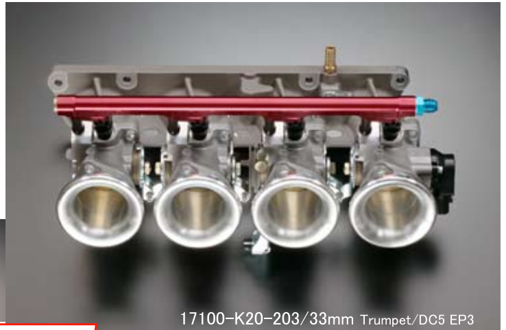
17100-K20-203/33mm Trumpet/DC5 EP3