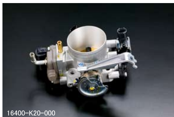
INTEGRA-R / CIVIC-R K20A (DC5/EP3)