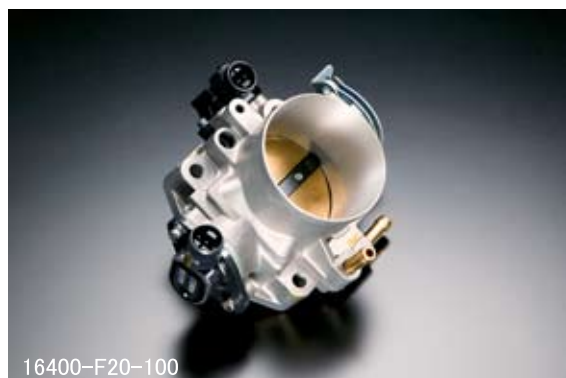
S2000 F20C (AP1)