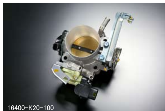
ACCORD EURO-R K20A (CL7)