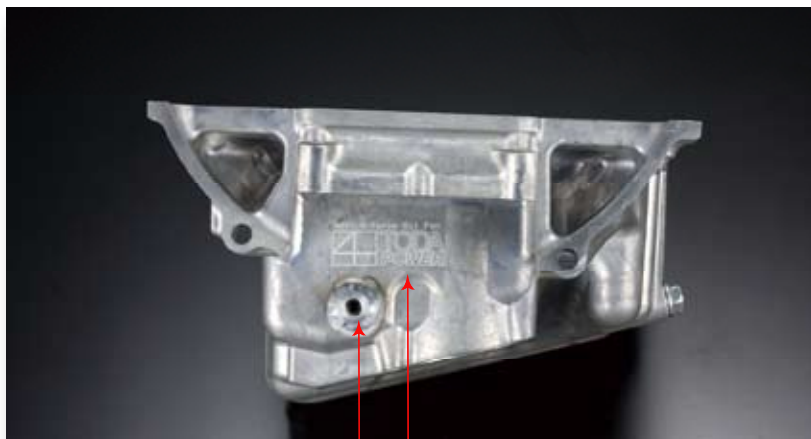
Extra service hole & TODA Mark

Anti G force oil pan FN2 CIVIC (K20Z) Price 59,000yen 11200-K20-N01